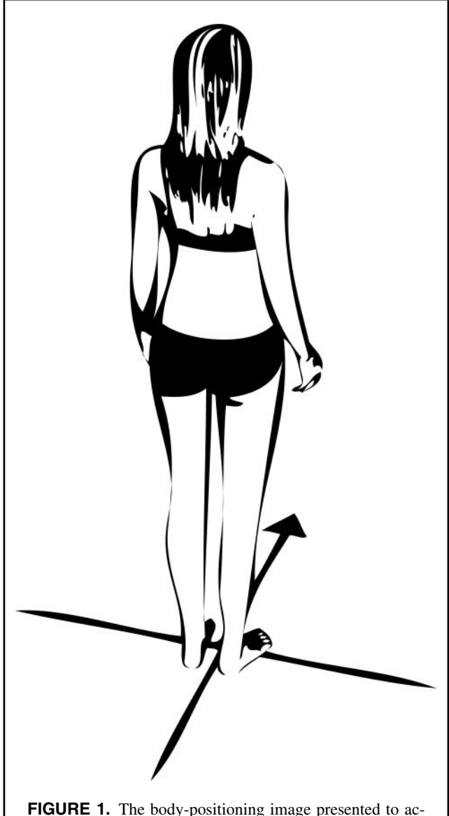
FIGURE 1. The body-positioning image presented to accompany the first instruction of every question in the Test of Ability in Movement Imagery: "Stand up straight with your feet together and your hands at your sides."